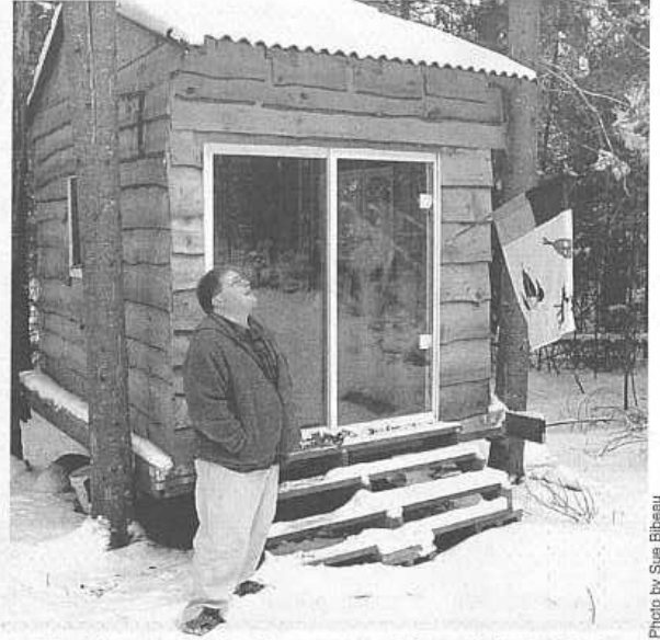
The king outside his Government House in Lake Clear.